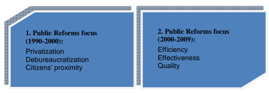
Figure 1: Portuguese public administration reforms since 90's

Portuguese public administration reform has been a constant process in the last decades and has been present in all the successive governments' agendum. Measures and proposals, concerning public reform, have marked all governmental programs no matter the party in the power. According to the analysis of Bilhim [2], Rocha [32] and Corte Real [8], since the 90's we can identify two different periods of reforms, with some different approaches and objectives as figure 1 point.